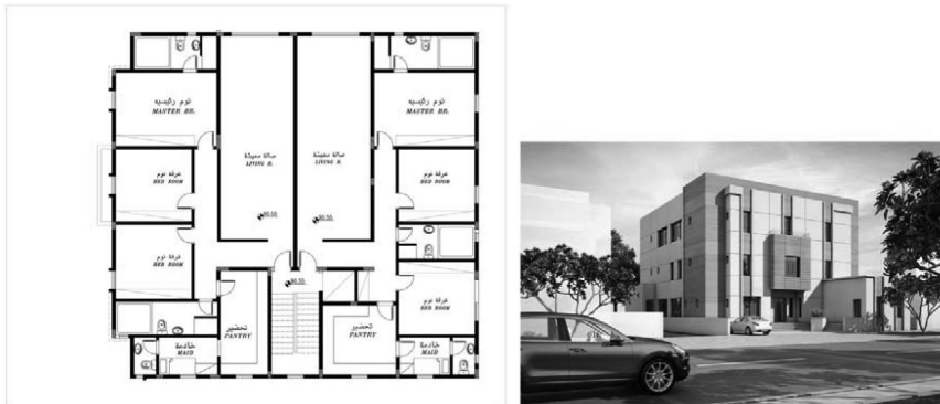
Figure (2) - Apartment in a detached house- Al-Shaheen Consultants

This term describe developments in High and medium residential areas that are more dense than low density single family suburban areas. These areas allow the construction of high rise residential buildings that house multiple residential units (apartments). It has been the trend that such residential type is mostly occupied by expats living in Kuwait.(See Figure 4).