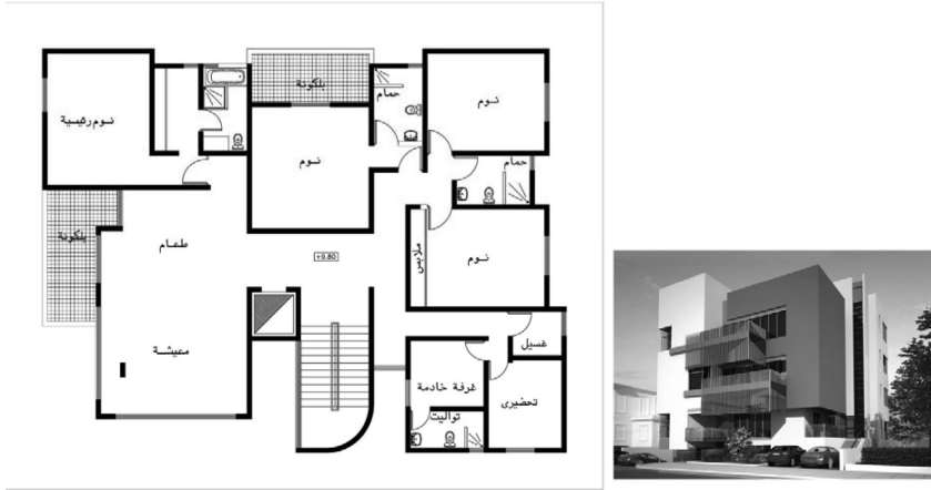
Figure (3) - Floor in a detached house - © Al-Shaheen Consultants