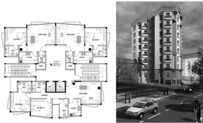
Figure (4) - APARTMENT IN A MULTI STOREY BUILDING - AEAI-Shaheen Consultants