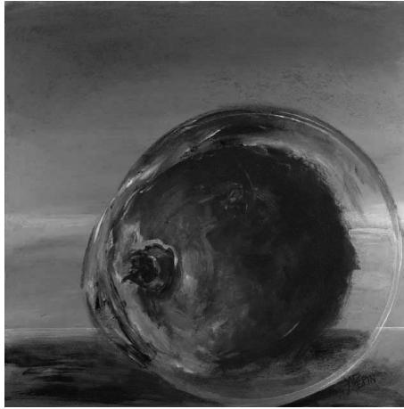
Fig. 8. Pomegranate-Tanned Water Hide

Over 30 interviews were conducted with subjects ranging in age from 25 to 80 of both genders representing Kuwait, Syria, Iran, Egypt, Palestine, Jordan, Iraq, and the United Arab Emirates. However, because of redundancy, just 30 of the interviews were used.