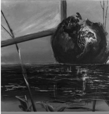
Fig. 9. By Sea