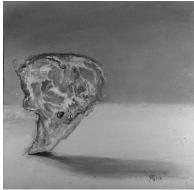
Fig. 13. The Last Seed

I created two paintings based on these interviews. Additionally, I altered the skin to appear in the shape of a shucked oyster shell, wherein the ruby-red seed could also serve as metaphor for a precious pearl, a symbol itself of some parts of the Middle East's historic past (see Figure 13).