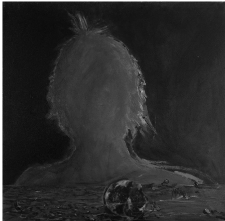
Fig. 15 Cardamom - Pomegranate Song

I made two paintings reflecting the dualistic roman and cardamom seed (see Figure 15).