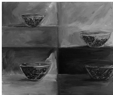
Fig. 14. Chilled Seeds

Food: Respondents described how seeds were scraped out of the fruit, and then the fruit was mixed with sugar and a little water before refrigerating the mixture for later, chilled consumption. This fruit-sugar mixture was preferred over drinking the juice as a way of ingesting pomegranates (see Figure 14). The most common means of removing the seeds from the husk was said to be cutting the orb in half and hitting the outside with a spoon.