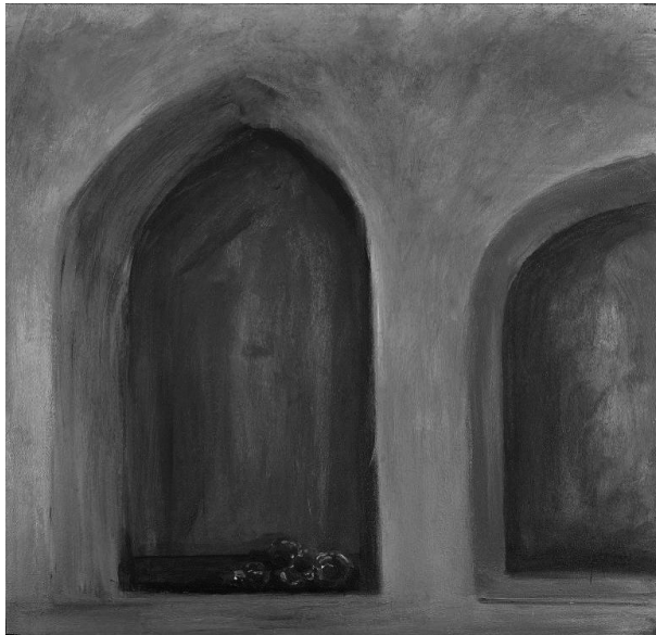
Fig. 11. Niche Series

The Niche Series is actually a sub-series in this series of pomegranate paintings. It was inspired by an interview with an older respondent who recalled that pomegranates were long ago stored in hay or straw inside clay tanours (ovens) or roushinah (depressions made in the walls of the old coral and clay houses). Her recollection opened my eyes to niches in historic buildings and incorporated into contemporary architecture later discovered in travels around the Middle East (see Figures 11 and 12).