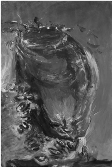
Fig. 3. Series #2

“Pomegranates Plus,” is a 30”x50” series of 40 acrylic-on-paper paintings. The paintings are abstract and symbolic - the colors and shapes found within the fruit when broken open express a range of feelings resulting from interacting with the infrastructure of an Islamic country (see Figures 3 and 4). An exhibition of over 30 of these paintings was held at one of Kuwait’s commercial art galleries, and drew a large number of viewers from all areas of the Middle East.