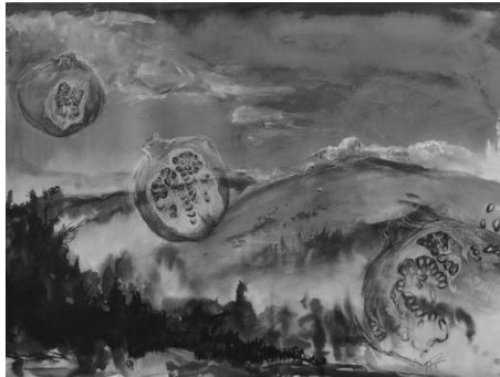
Fig. 1. Series #1

In an improvised studio (the dining room table) in university faculty housing, I painted over and added pomegranates on each canvas. Working from life, pomegranates, which are plentiful in Kuwait's markets, substituted for inspiration I found in the landscape of my homeland. "Pomegranate Evolution" depicts my imagined and mythological story of how pomegranates came to earth - beginning as a celestial star, exploding, and in varied stages falling to Earth. This series of 24 paintings paved the way for a larger, bolder series (see Figures 1 and 2).