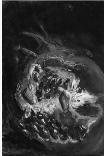
Fig. 4. Series #2

Viewers at this exhibit each had her or his own associations of the pomegranate in their lives and culture. Inspired by their stories, I wrote and was awarded a Kuwait University research grant to further study the pomegranate as it appears in Middle East arts and culture.