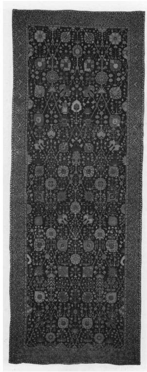
Fig. 5. Medallion Carpet LNS 25R, The al-Sabah Collection Dar al Athar al-Islamiyyah, Kuwait

It is interesting to note that before the advent of synthetic dyes, the red coloring used to represent pomegranates in textiles consisted primarily of madder or madder warty (23). The skin of the pomegranate was also used to produce yellow-ochre dyes.