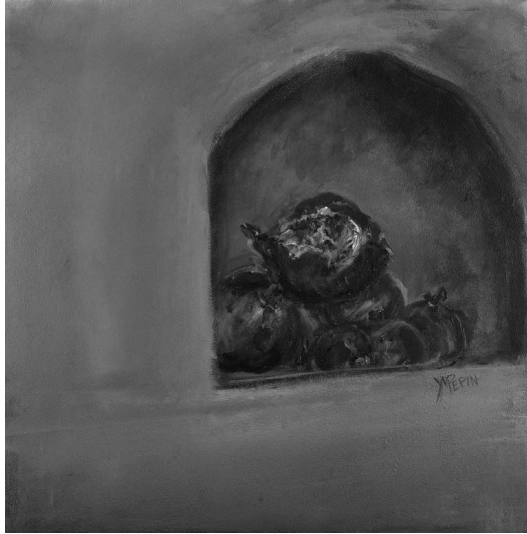
Fig. 12. Niche Series

Both younger and older respondents made reference to using every seed in the pomegranate. They cited the Islamic Holy Book, the Qur'an and the Prophet Mohammed (PBUH), who said every seed of a pomegranate should be eaten because one of them was from Heaven.