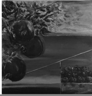
Fig. 10. By Land

The Niche Series is actually a sub-series in this series of pomegranate paintings. It was inspired by an interview with an older respondent who recalled that pomegranates were long ago stored in hay or straw inside clay tanours (ovens) or roushinah (depressions made in the walls of the old coral and clay houses). Her recollection opened my eyes to niches in historic buildings and incorporated into contemporary architecture later discovered in travels around the Middle East (see Figures 11 and 12).