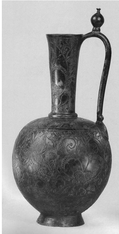
Fig. 7. Vessel LNS 132M The al-Sabah Collection Dar al Athar al-Islamiyyah, Kuwait

the Middle East surfaced during interviews conducted with representatives from this region. These stories provided background information not reflected in the literature review of the art and architecture of the past. Information gained during interviews offered me intangible information which I transformed into visual documents, to create a new series of pomegranate paintings.