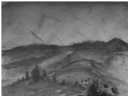
Fig. 2. Series #2